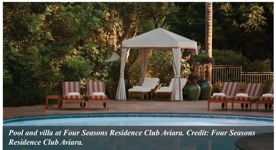
Pool and villa at Four Seasons Residence Club Aviara.

Nearby, Residence Club owners can enjoy the amenities of Four Seasons Resort Scottsdale, including the Talavera and Proof restaurants, a spa, tennis courts, and priority tee times at Troon North golf club. Opportunities for mountain biking and guided nature walks also are available.